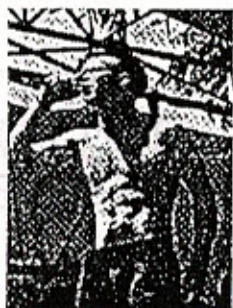
Joe from INFeCTed

Local industrial giants Infected have scored the Napalm Death support this month. Check gig guide for details, and grab a copy of 'Trial' if you don't already have it.