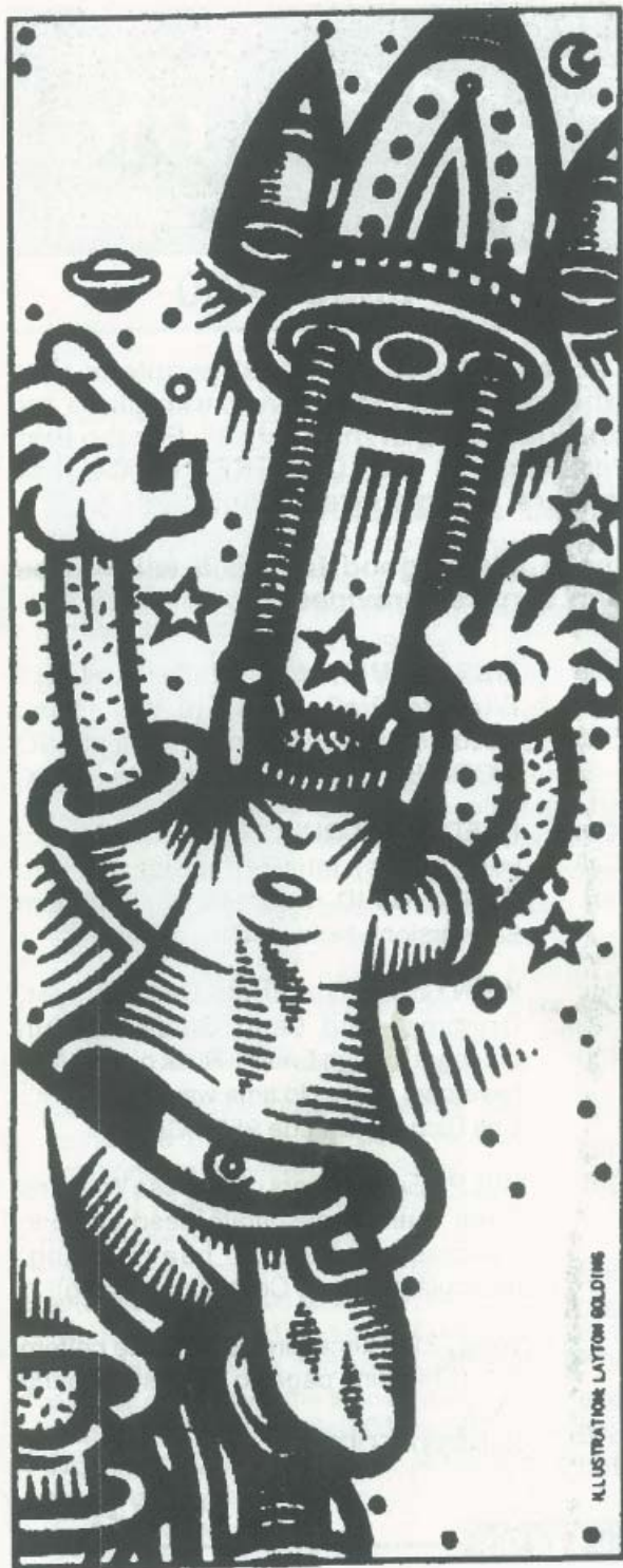
ILLUSTRATION LAYTON GOLDING