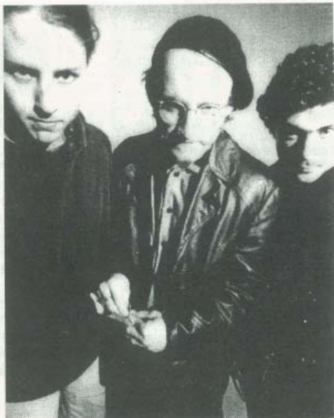
Cinema Prague circa 1995

P.U.M.P.I.N. promotions brings you the best of new and old with Hot Summers Day , featuring local heroes such as Cinema Prague (just back from Europe), Spank , Squidfinger and DJ Malcolm , as well as the best of Perth's new breed, inc.