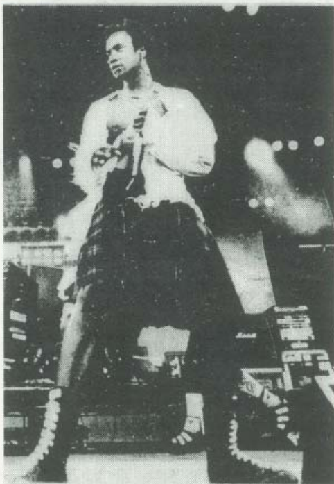
Maxim@perthent.cent.

"Yeah, I got a solo album coming out this year," says Maxim. "Being in The Prodigy I don't get too much time to do stuff on my own. But I'm just like everyone else; everyone has their own vibes and inspirations. This is my chance to get my vibes and inspiration out on a solo tip, so people can hear what the other side