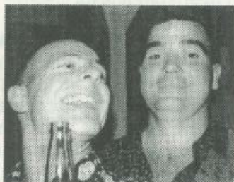
Shutterbug & Mud @ Mojo's: Pic Glen